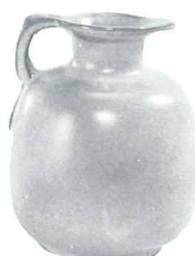
833-24 OZ. PITCHER 3.75