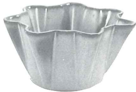
F33-3 3/4x7" FLUTED PLANTER 5.50