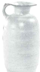
831-16 OZ. PITCHER 3.75