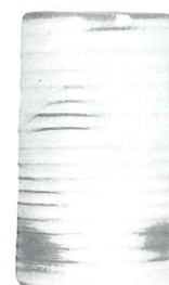
172-6 1/2" RINGED CYLINDER VASE 4.75