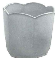
37-4" HEXAGONAL PLANTER 3.25