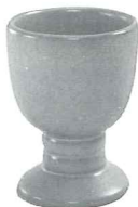
26LC-4 1/2"-6 OZ. TUMBLER VASE 3.25