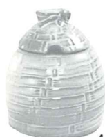
803-HONEY JAR W/LID 4.75