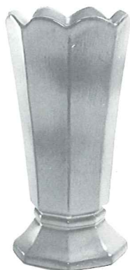
64-9 1/2" OCTAGONAL VASE 7.75