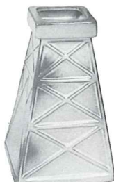
199-OIL DERRICK VASE 7.00