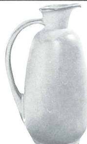
835-24 OZ. PITCHER 3.75