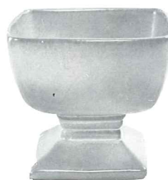
23A-6" SQ. PEDESTALLED VASE 6.50