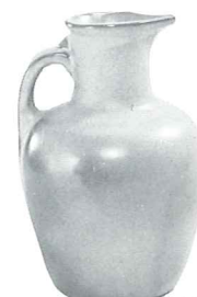
8-24 OZ. PITCHER 3.75

AVAILABLE IN 8 STANDARD COLORS PLUS TERRA COTTA & COFFEE BROWN EXCEPT WHERE NOTED — ADD 50% FOR FLAME