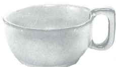
4SC-5" CUP-BOWL 3.75