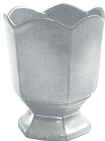
65-6 1/2" HEXAGONAL VASE 6.50