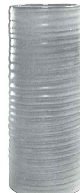
72-10" RINGED CYLINDER VASE 6.50