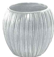
T7-3 1/2" COCONUT PLANTER 2.75