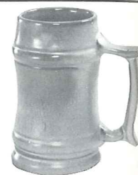
M2-6"-18 OZ. MUG 4.50