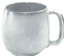
4M-4 1/2"-18 OZ. MUG 4.50