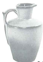
838-10 OZ. PITCHER 3.25