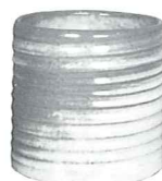
272-4" RINGED CYLINDER VASE 3.25